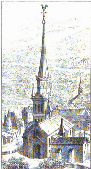
THE SPIRE OF SALLANCHES (FROM A PRINT OF 1697).

What do the tourists of to-day see of this once celebrated landscape? Having lived two autumn months among these Lesser Alps, I can judge pretty well. In the hottest, cloudiest afternoon hour three huge, yet generally overcrowded, vans stagger up to the door of the Hôtel des Messageries at Sallanches. There they discharge their hungry, thirsty, ill-conditioned load with half an hour's leave to snatch, gulp, grumble, and pay. Then the personal conductor again marshals his following and the caravan departs as it came in a dust cloud of its own making, dense enough, even were the sky otherwise clear, to destroy all pleasure of vision, to poison all delight of breathing. Much-doing, more-done tourists, how we pitied you as, lying reclined in remoto gramine in the